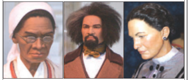
Sojourner Truth Frederick Douglass Elizabeth Keckley

Since its opening in April 2005 the Abraham Lincoln Presidential Museum and Library, a $150 million project in downtown Springfield, Illinois has drawn over 600,000 visitors.