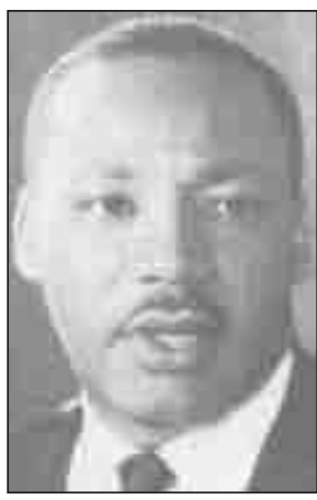
Dr. Martin L. King, Jr.

Atlanta/GA...The City of Atlanta has announced that a deal has been struck to bring the coveted Martin Luther King Jr.'s collection of handwritten documents and books back to Atlanta. The items valued at $15 million to $30 million were scheduled to be sold at Sotheby's auction house in New York.